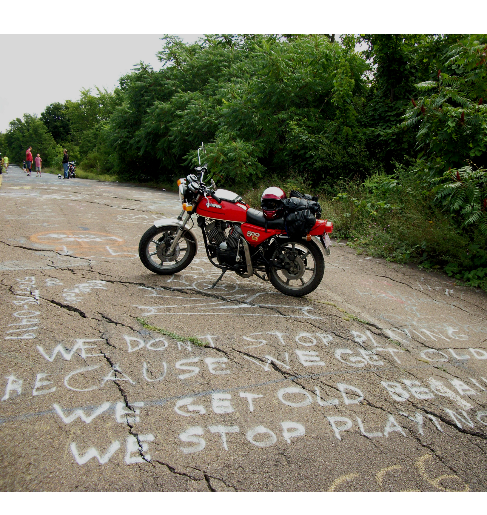
LESS IS MORE! August 17,18,19,20, 2012